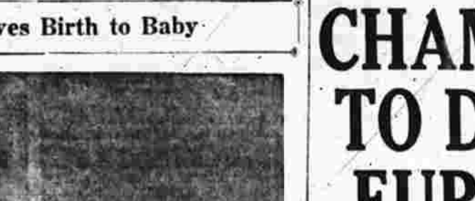
Girl, 5, Gives Birth to Baby

Non-Cooperation And Economic Pressure Replace Big Demonstrations Leaving Considerable Dead.